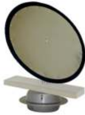
Round Plenum Damper