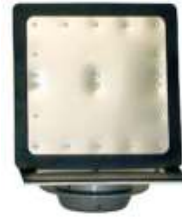
Square Plenum Damper